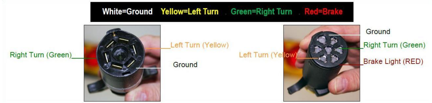
7-Pin RV Style